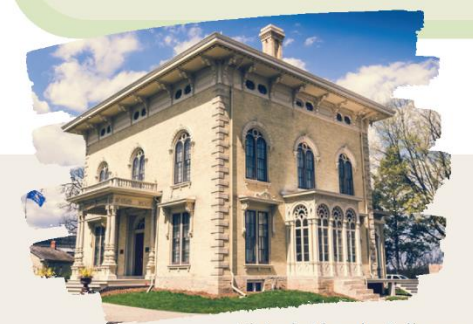
Historic Lincoln-Tallman House Museum